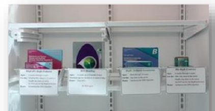
Reprinted from the CDC's Vaccine storage and Handling Toolkit